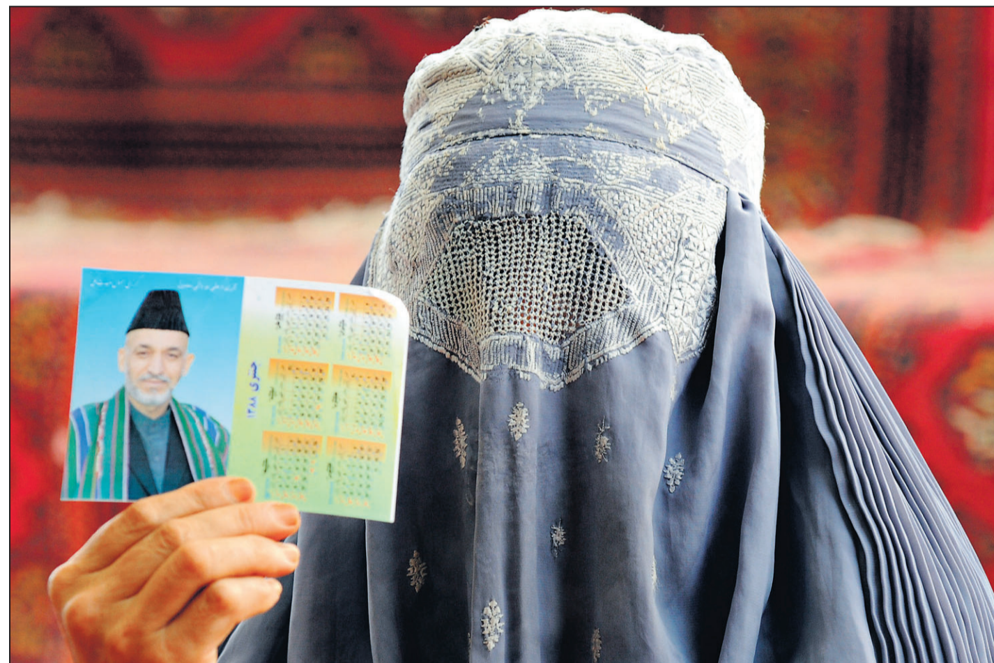
Calendar boy... at an election gathering in Kandahar, a woman shows her support for President Hamid Karzai.