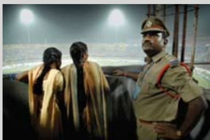
"India's IPL Fans"