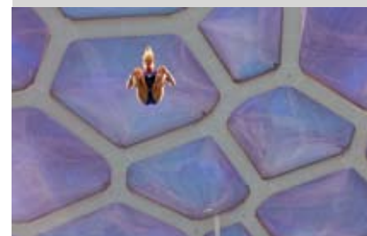
Ezra Shaw, Getty Images, "The Dive"