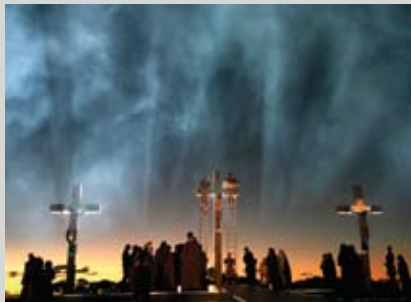
"World Youth Day"