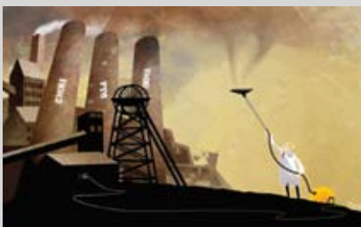
Pat Campbell, The Canberra Times , "Coal Climate"