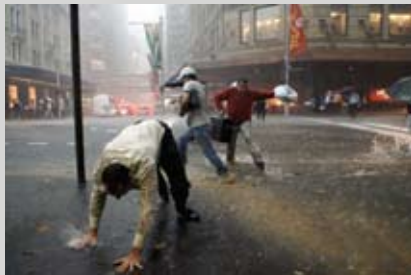
"December Storm"