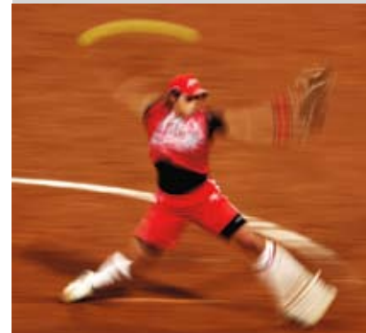
Phil Hillyard, The Daily Telegraph , "Best of the Best"