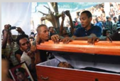
Glenn Campbell, The Age , "The Funeral of Alfredo Reinado"

packages from the field to convey the dramatic struggle to reach survivors of the earthquake in China's Sichuan Province.