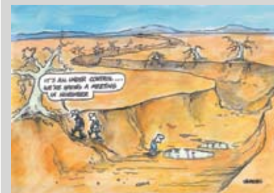
Ron Tandberg, The Age , "The River Bed"